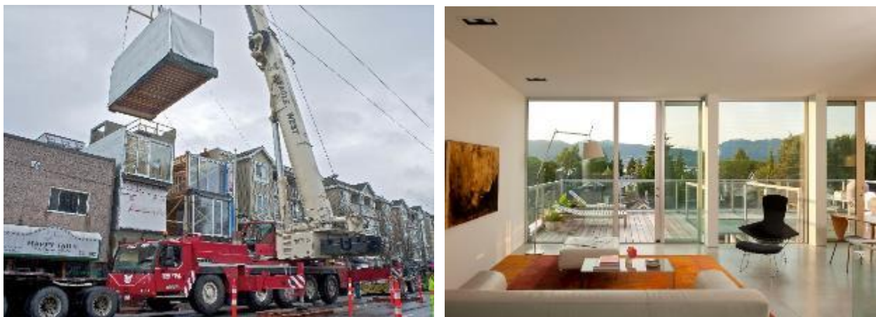
Figure 2. ‘Monad’ by LWPAC+IC. Construction of a modular housing project with stick-frame modules (left) and the resulting interior space (right) in 2012.

Quality and affordability are not mutually exclusive if the industry embraces technological innovation. A previous project by LWPAC+IC was assembled from prefabricated modular construction in 2012 and proved that design quality and livability can be much more affordable if design and construction processes are rethought in the context of technological innovation (fig. 2).