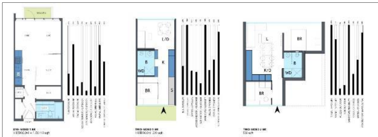
Figure 3. Evaluation of livability criteria for three different apartment types: a 1BR one-sided apartment (left), a 1BR two-sided apartment (middle), and a 2BR two-sided apartment (right). Due to the double-sided exposure of the latter two, many criteria are evaluated higher.

Visualizing these criteria can inform all stakeholders in the earliest stages of the design process. But most importantly, they can be implemented in a parametric design model that can generate and evaluate different options automatically, to help with multi-variable decision making. While similar methods have been applied for design processes in the past (Beesley et al. 2006, Camporeale and Czajkowski 2015) the presented process is different in two ways: First, it’s a tailored evaluation for the generation of building typologies but still adaptable enough to generate many different solutions in many different urban scenarios. And second, although being a preliminary process in an early design stage, the next chapter shows how these calculations are directly linked to a parametric building information model that generates all architectural and constructional elements.