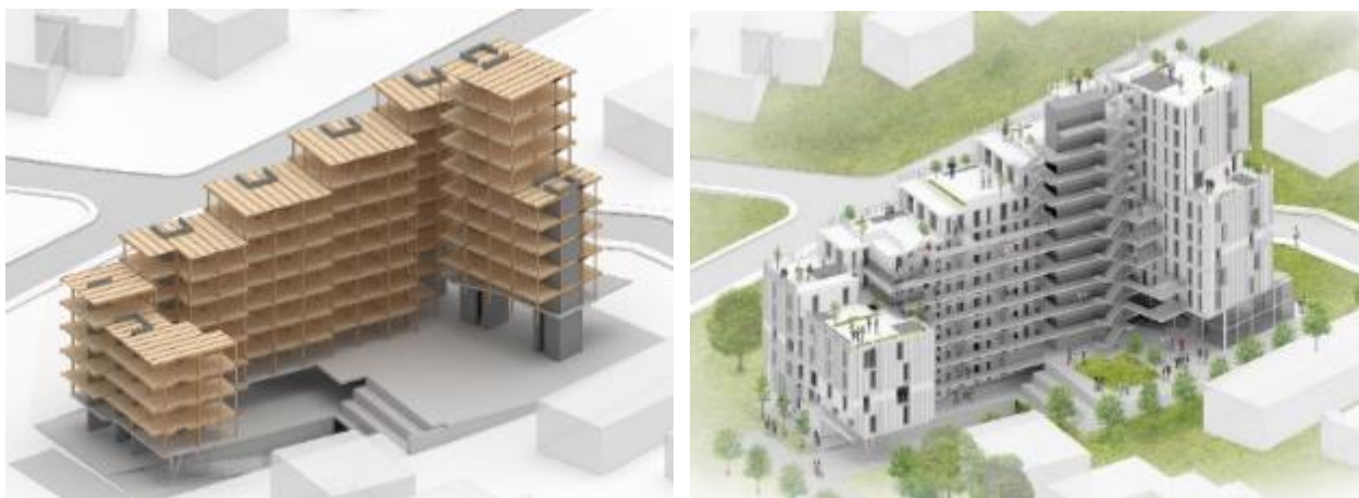
Figure 1. Mass timber construction system (left) and the finished building (right) of the 12-storey 'Corvette Landing' mid-rise urban housing project beginning construction in early 2019.

Both the pace and demand for urbanization and urban densification have led to a highly formulaic and unsustainable status quo of development models focused on investment return and profit without a desire for quality in built form. The lack of available housing solutions and choice is made worse by the affordability crisis we can see in so many North American cities. In a recent study, 32 out of 50 locations analyzed in North America were either "seriously unaffordable" or "severely unaffordable", with an affordability median multiple of more than 4.1, and Vancouver at first place with a multiple of 17.3 (Mindru 2017). Meanwhile, the population of the world's urban areas is increasing by 200,000 people per day (Renz et al. 2016). In addition, changing needs and desires of urban dwellers caused by social and cultural transformations in the last decades are outpacing the adaptability of static urban housing models, making them even less attractive. This lack of housing diversity serving a modern life style has prompted a re-examination of urban livability, building typologies and the design and delivery process in architecture and planning. The companies's holistic approach, called Platforms for Life (P4L), is based on these criteria and is currently being applied to a 12-storey mass timber building in British Columbia (fig. 1).