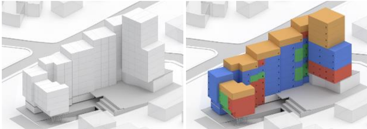
Figure 4. Steps of the parametric design process: First, an urban volume gets generated adjusted to the site constraints (left), then the volume gets populated by different home typologies (right).

Although some of these functions are still under development, the necessary paradigm change for this process already becomes evident when looking at the development of the construction system. Instead of defining the system by drawings and 3d models, every building element is parametrically defined. A building module consists of many elements that are only defined by their geometric relation to the module bounding box and neighbouring elements. For example, columns are defined by their cross section based on the height of the building, and their position in relation to the overall grid, which in turn is defined by the overall building shape and how modules are placed in relation to each other. If a column changes position or dimension, other building elements such as steel connectors or CLT panels adapt accordingly.