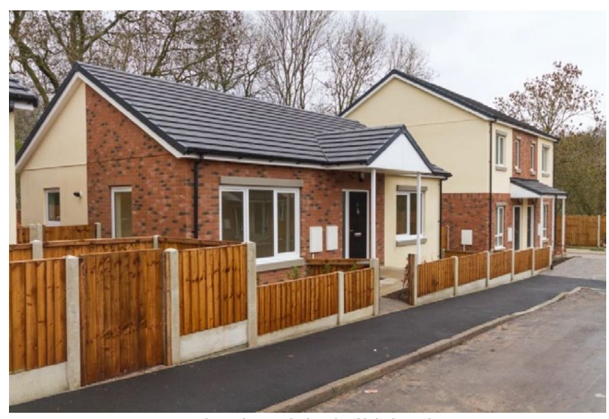
Figure 2 Completed Modular build development

projects. The visit also confirmed that the new homes would be covered by a National House