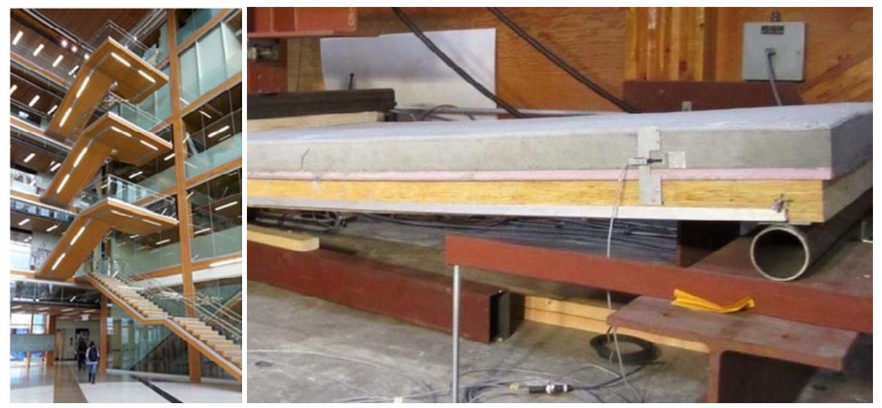
Figure 1: Earth Sciences Building staircase (left) and TCC floor tests (right) (Dias et al. 2015)

While heavy timber mid-rise construction was an accepted practice in the early 20<sup>th</sup> century in Canada, nowadays, as a result of conservative design codes developed throughout the 20<sup>th</sup> century, the use of timber as a structural material is largely limited to residential light-frame construction. TCC floors offer the potential for an increased use of timber in non-residential construction (Dias et al. 2016). One prominent example that showcases the innovative use of wood is the Earth Sciences Building in Vancouver. It is best known for its free-standing timber staircase but more relevant in the context of this paper is that the building is one of the first applications of a TCC floor in Canada. As an alternative building solution, a series of full scale bending tests were required, see Figure 1 (right). Since the system performance according to the design predictions, it was implemented in the ESB.