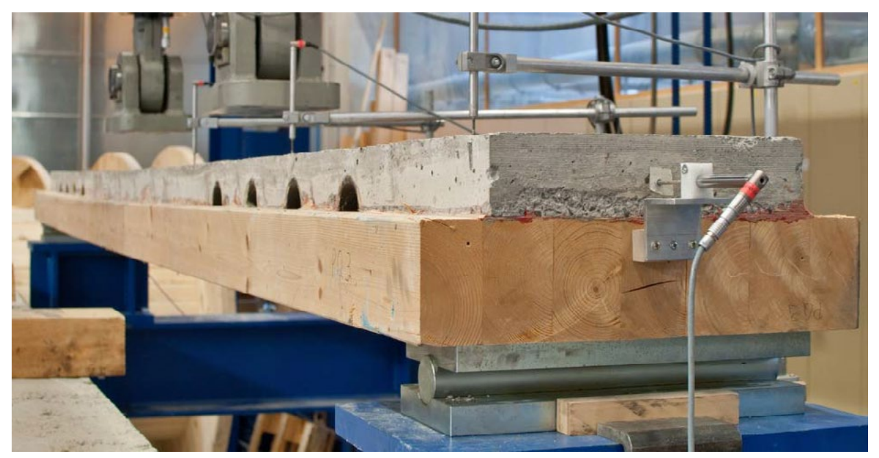
Figure 4. Adhesively Bonded Timber-Concrete-Composites

In subsequent work, Tannert et al. (2014) reported on long-term loading for 4.5 years and subsequent destructive testing of two adhesively bonded TCC beams. At the interface of each beam, plastic half-pipes were placed to reduce the total weight and to create the possibility of running conduits through the finished floor, see Figure 4. During the long-term loading, the indoor environmental conditions and the deflections were monitored. After having been loaded for 4.5 years, the beams were tested to failure, resulting in findings that long-term loading caused no degradation of the adhesive bond. For design purposes, a simplified approach proved sufficient to approximate the observed deflections caused by creep and shrinkage.