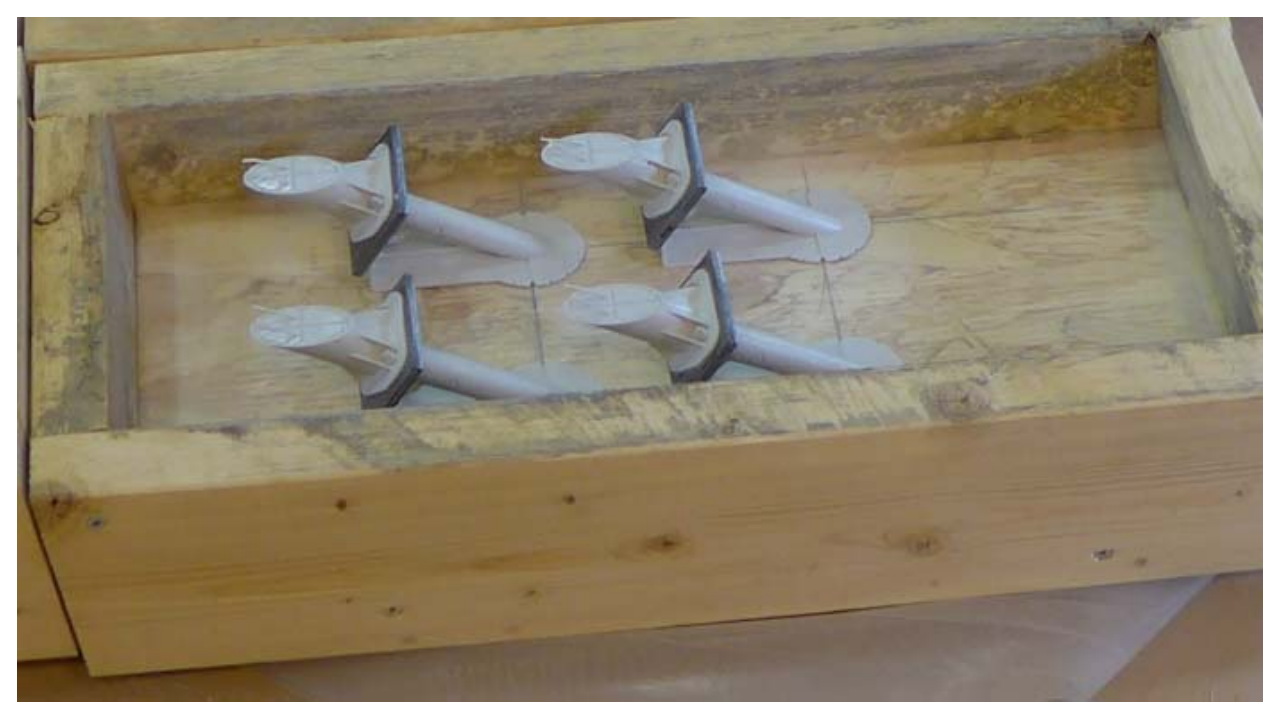
Figure 5. Timber-Concrete-Composites using FT connector

Tests utilizing the FT connector system were performed at the University of British Columbia (Gerber and Tannert 2015) using 240mm long fully threaded screws and different engineered wood products. Despite the high load carrying capacity, the results captured several drawbacks to the system: the connectors proved to be less stiff than utilizing the same screw configurations, and more importantly, they exhibited higher levels of residual displacement following initial loading which translates into potentially large unrecoverable deformations in the final structure. The larger residual deformations are likely a result of oversizing of the hole through which the screw is installed in the FT connector. The gap between the edge of the sleeve and the screw then needs to be closed before the stiffer axial load path can be activated.