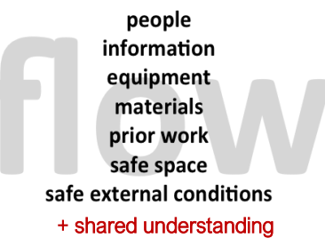
Figure 1. the eight flows required for work to be successfully done. Sources: Koskela 2000; Pasquire & Court 2013; graphic Mossman.

Although CPM-based approaches are used to manage production, they are not fit for purpose. There is no systematic check within CPM systems that work can be done (Ballard & Howell 1995; 2003). Winch, (2002) suggested that project programs are often effectively formed during the tender or preconstruction period [by office planners] and quickly become enshrined within the master construction program and then constrain programmes developed later. In addition, it is impossible to maintain a complete, up-to-date plan in the way envisaged by the proponents of CPM-based project management (Koskela and Howell 2002).