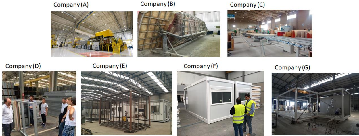
Figure 3. Conducting empirical studies in factories